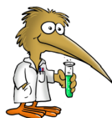
Kiwi Science Competition

Ask your teacher for details and entry form.