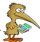
Kiwi Maths Competition