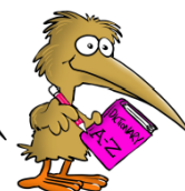
Kiwi English Competition

Designed by NZ teachers for Kiwi students based on NZ curriculum.